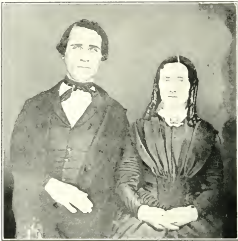
From an Old Daguerrotype.